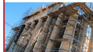
Athens: Heritage and Modernity

This is a thoughtful exploration of the history, preservation and conservation issues facing the city, organized around a series of lectures and visits lead by some of the top Athenian archaeologists, architects, historians, conservators and planners who have been dealing with the problem of surveying, planning, and preserving monuments and cultural heritage in the midst of a growing modern city. Please visit our website and syllabus to see a complete list of faculty, lectures and visits. Also visit our Facebook page. The program is intended for people studying, or professionally involved in, the fields of: History, Archaeology, Architecture Art History, Architecture, Urban Planning, Anthropology, Conservation and Historic Preservation, but is also open for people with a general interest in any of the above mentioned subjects. Our deadline for applying is May 1 st , 2015 .